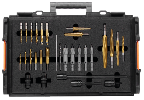
STC-EMID-MEIK (supplied in STAKIT EMID case)

Portable, site-focussed kit for fast hole creation, enlarging & aligning with Impact and Rotary tools